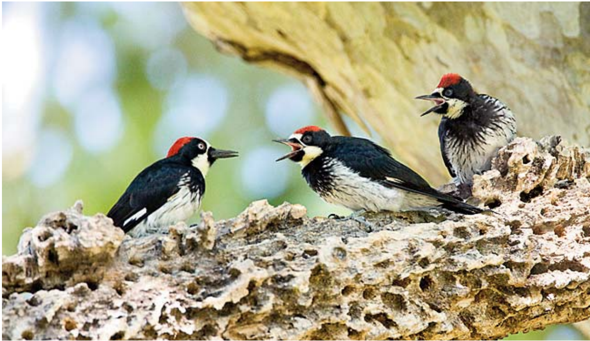
Fig. 1. Two fledglings on the right (note dark eyes and male-like crown plumage) begging from an adult (with white eye on the left). Also note the granary limb pock-marked with storage holes used for storing acorns.

a connection with dominance, since males are generally dominant over females within birds of the same (breeder or helper) status (Hannon et al. 1987). Why this would not apply to birds in Colombia is unknown. This character would be relatively easy to manipulate experimentally, however, and behavioural observations, although difficult, could potentially reveal the fitness consequences of juvenile plumage, at least at the intraspecific level.